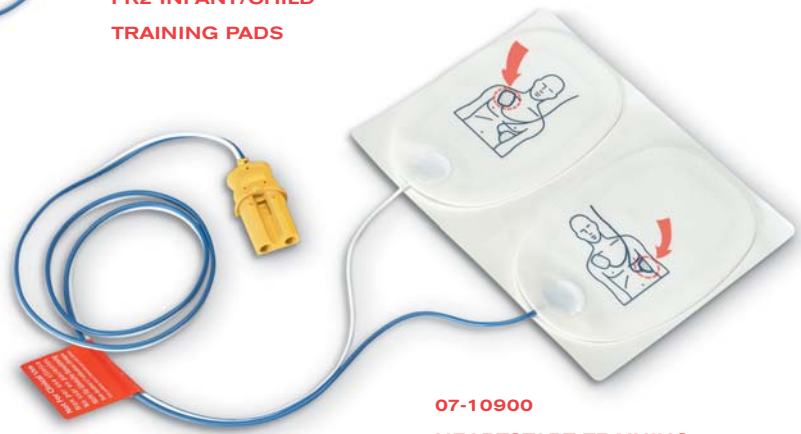
07-10900 HEARTSTART TRAINING PADS