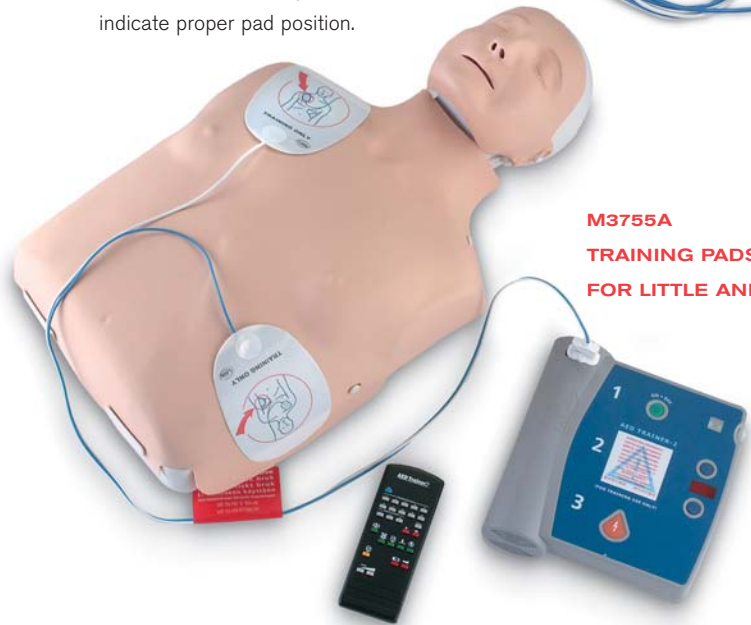
M3755A TRAINING PADS FOR LITTLE ANNE